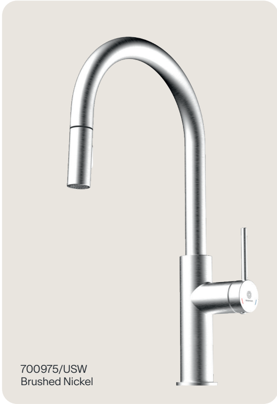
700975/USW Brushed Nickel