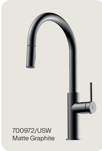
700972/USW Matte Graphite