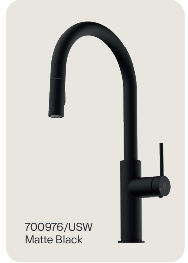
700976/USW Matte Black