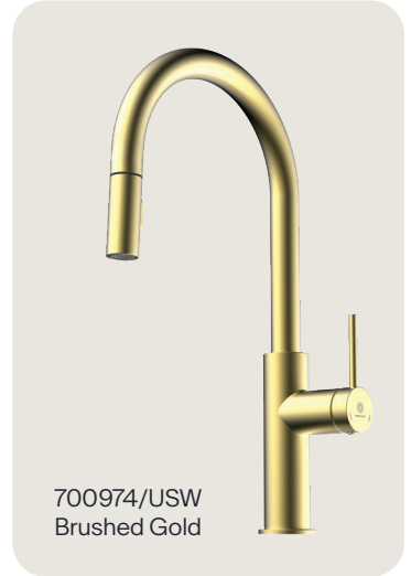
700974/USW Brushed Gold