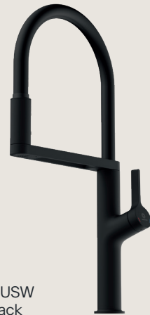
700916/USW Matte Black