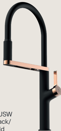
700917/USW Matte Black/ Rose Gold