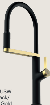
700918/USW Matte Black/ Brushed Gold