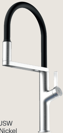
700915/USW Brushed Nickel