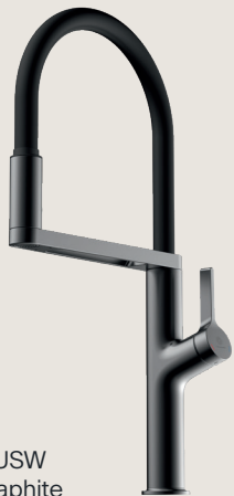
700912/USW Matte Graphite